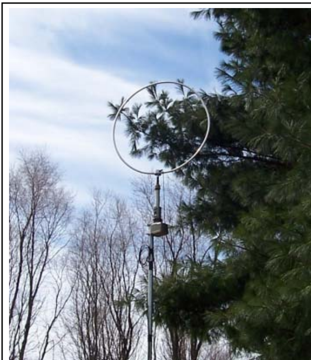
Small loop sits behind a pine tree for protection from the wind. Mounted 10 feet off the ground, it's a little higher than recommended. The lower the better with one of these.

The Wellbrook is an active antenna and Andy, the guy who makes them in Beulah, Llanwrtyd Wells, Powys, Wales, UK, has dipped the electrical circuits in epoxy for protection from the elements and probably to reduce of the risk of reverse engineering. The antenna's amp no doubt uses a broadband design with extremely high gain and low noise semiconductors. The results are stunning. So is the price, to be honest.... $330 USD including shipping from the UK. But when I look at my investment in radios, it seems silly to think I can get the best performance from them for only a few bucks worth of wire! Yeah, I know what you're thinking ....that's what my wife said.