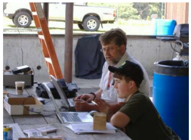
Field Day